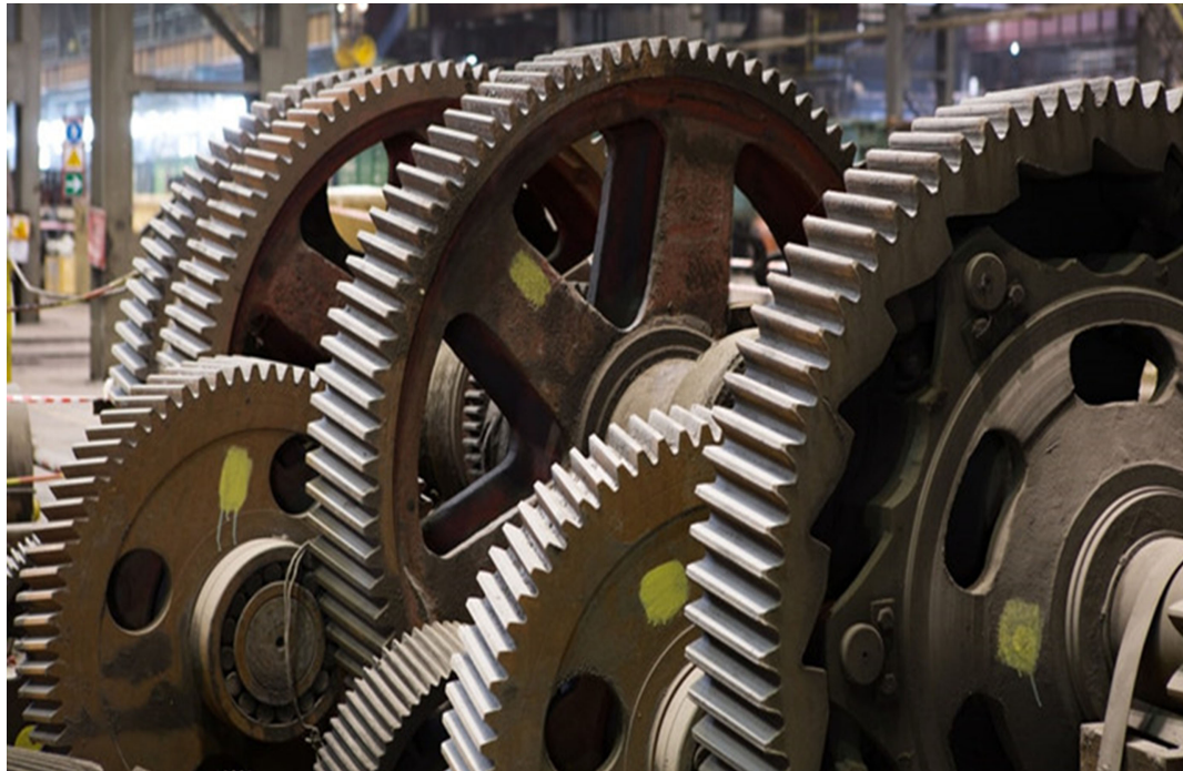
Figure 1 A pictorial diagram of the spur gear system