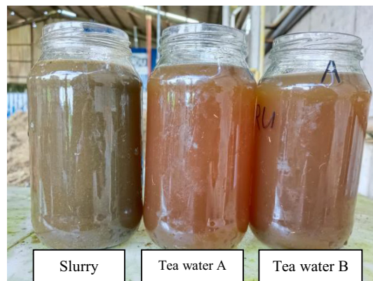
Figure 2 Physical appearance of slurry and tea water solutions

and tea water can be seen in Figure 2. The color of tea water is clearer than the slurry. Vermifilter can reduce sedimentation in tea water by up to 90% so that it can be used as a land application.