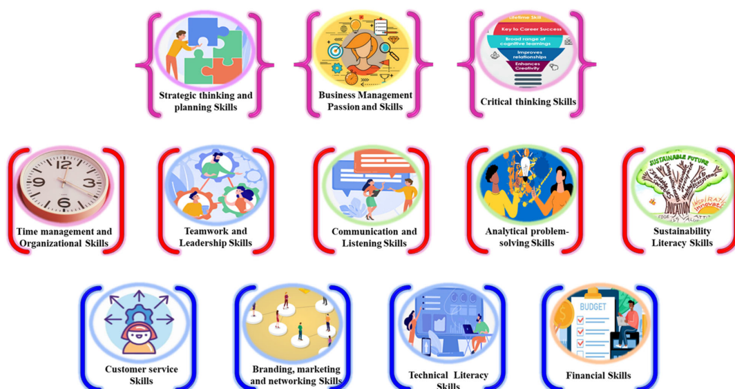
Figure 4 Entrepreneurial skills

Last but not least, another important ability refers to the ability to promote the newly created business. The ability to employ winning marketing tactics can be an essential point in growing into an entrepreneur. Innovation is critical in the sustainable