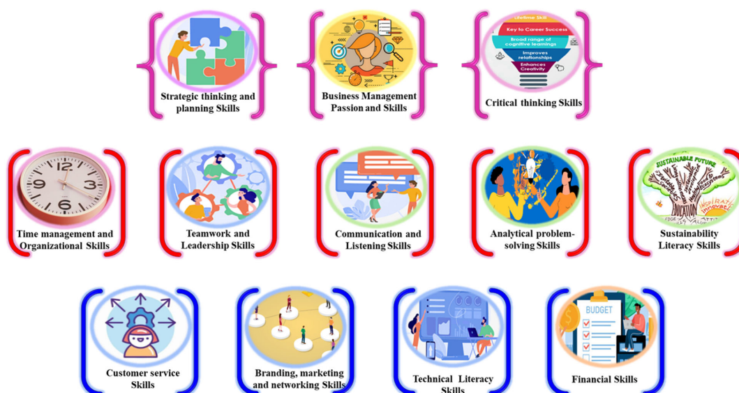
Figure 4 Entrepreneurial skills

Last but not least, another important ability refers to the ability to promote the newly created business. The ability to employ winning marketing tactics can be an essential point in growing into an entrepreneur. Innovation is critical in the sustainable