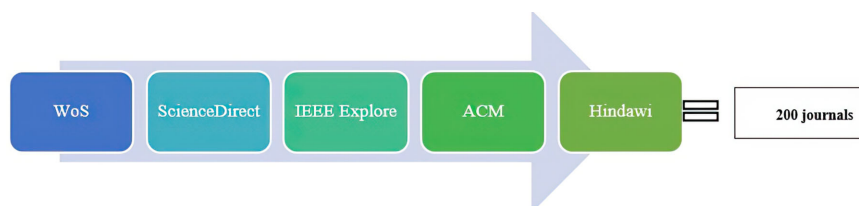
Figure 1 Sorting out relevant publications in regard to multi-depot vehicle dispatches and the corresponding field

MDVRP is used to perform simultaneous round-trip deployment, but most studies focus on niche issues surrounding this feature. Common approaches include solving multi-commodity dispatches, transportation tasks involving limited or fixed time windows, and multiple vehicle dispositions simultaneously. A commodity is a unit scheduled to be distributed according to demand and priorities. At the same time, time windows are the timespan that is allowed for the item unit to undergo complete distribution across participating sectors. Vehicle instances are the transportation method for ferrying the demanded item unit to the target distribution point. The overall