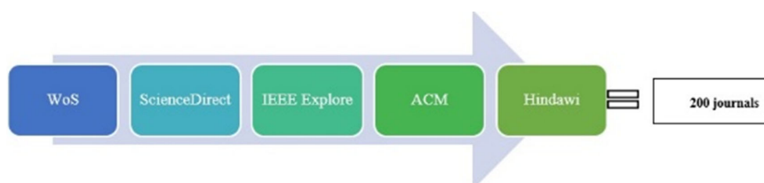
Figure 1 Sorting out relevant publications in regard to multi-depot vehicle dispatches and the corresponding field